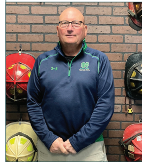
City of Lawrence Fire Department